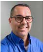
Fabiano Santos Communications