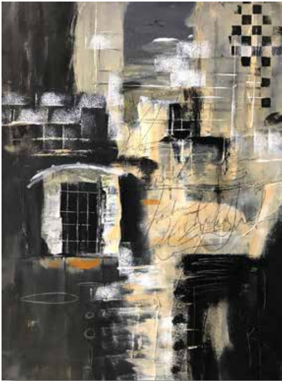
This Old House