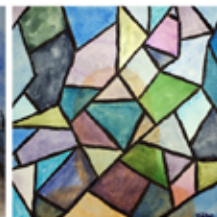
Julie Billing • Confusion & Disruption