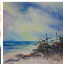
Sue Beach • Empty Beach