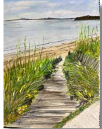
Pathway to Saint Cast Beach Sandra Kokenge