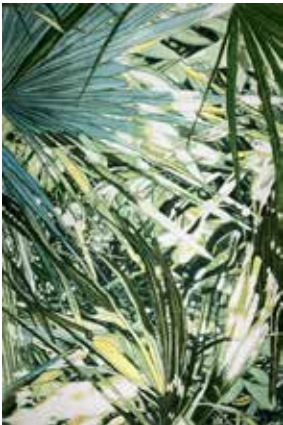
Palm Lights III